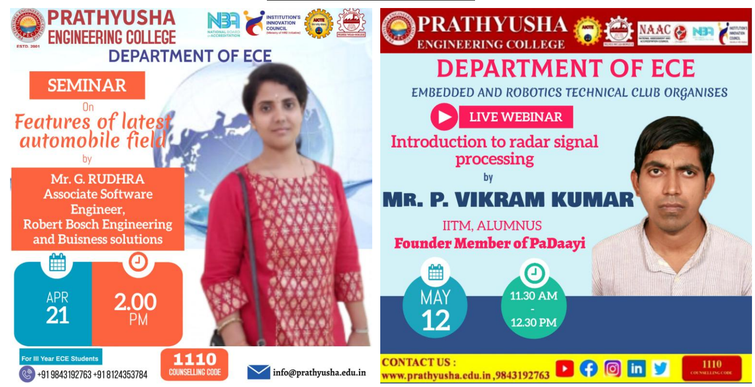
ONLINE EXPERTS' INTERACTION