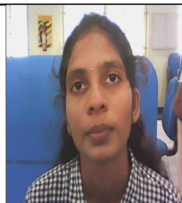
Test Day Photo