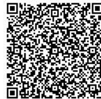
K Ganesan Global Head Talent Acquisition & AIP

Click here or use a QR code scanner from your mobile to validate the offer letter