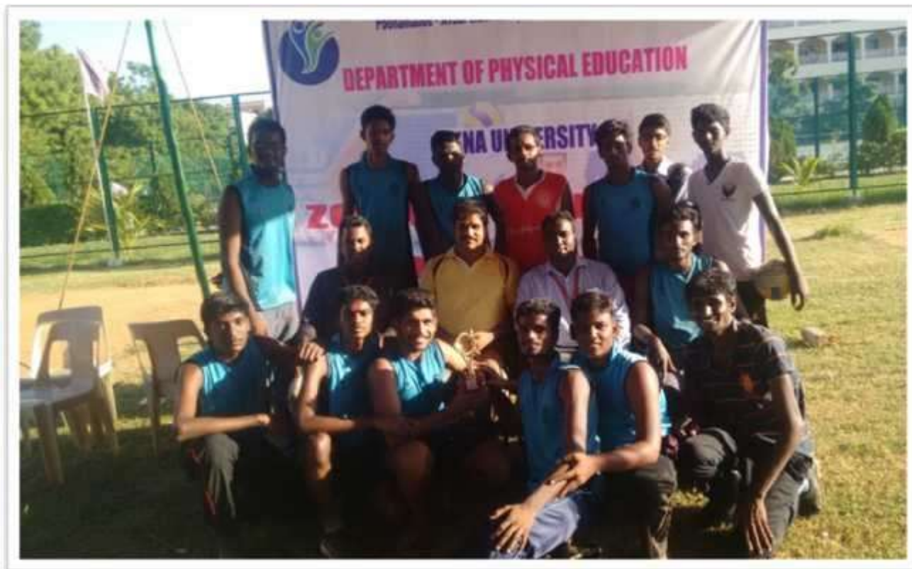
Anna University zonal tournament Prathyusha Volley ball team secured third position