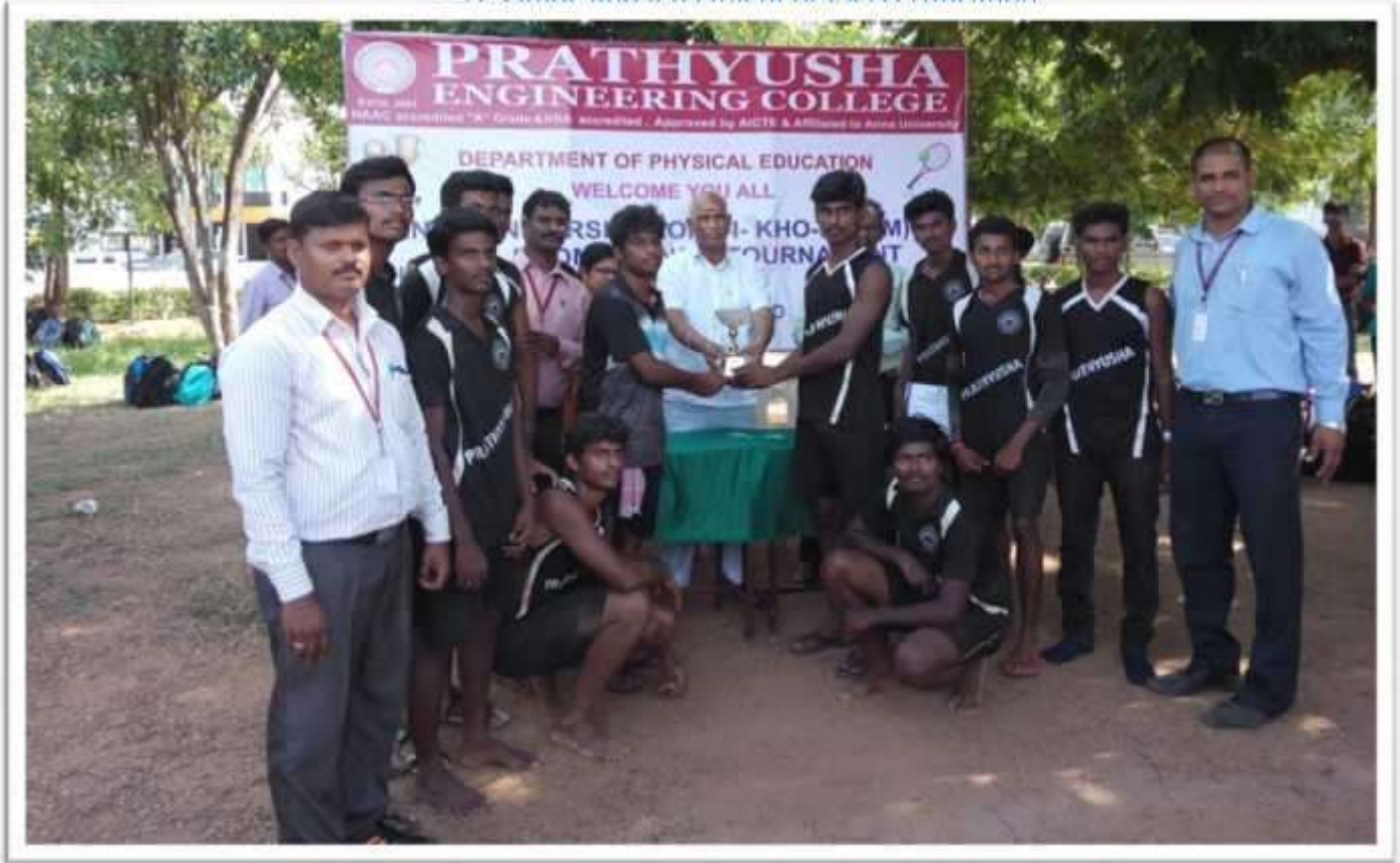
Anna University Zonal Kho-Kho Tournament Held at Prathyusha & secured Third place

Anna University/Approved by AICTE, Accredited by NBA/NAAC -'A' Grade and a recipient of ISO certification.