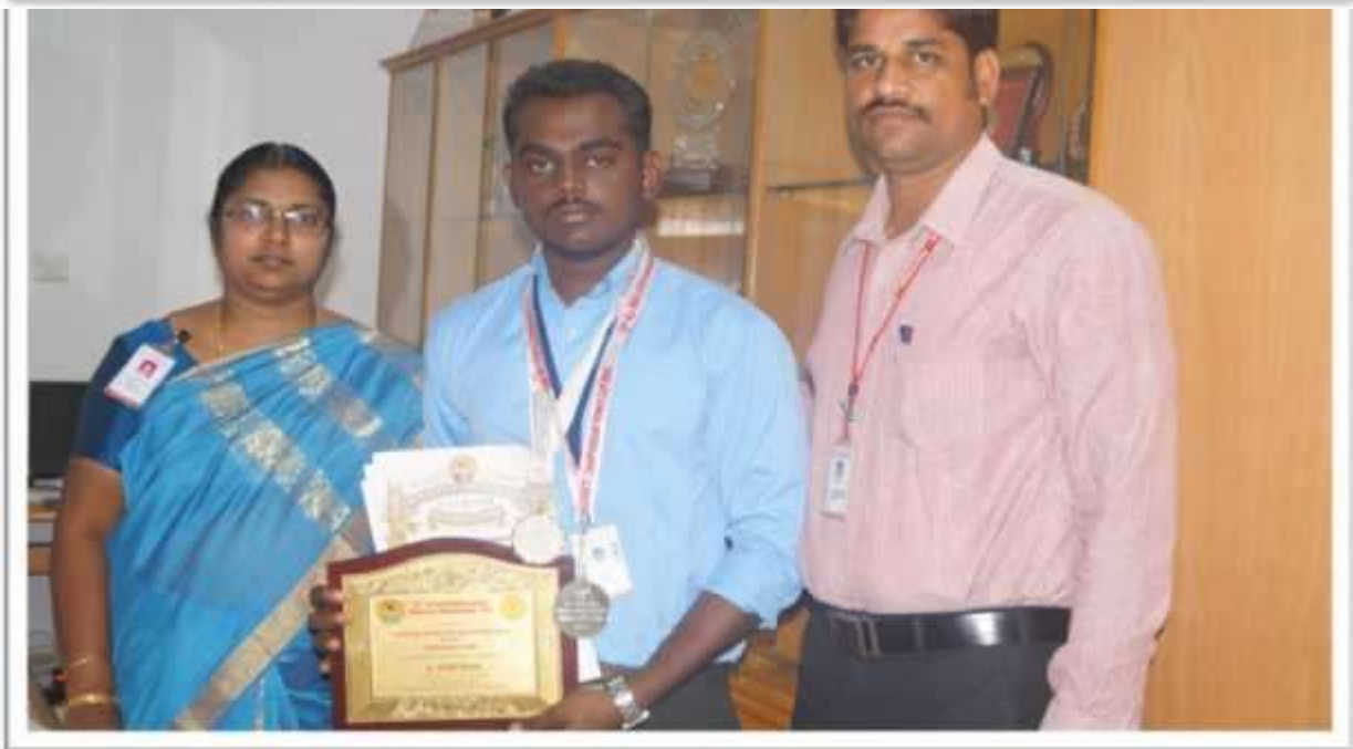
Gold medal in katta.