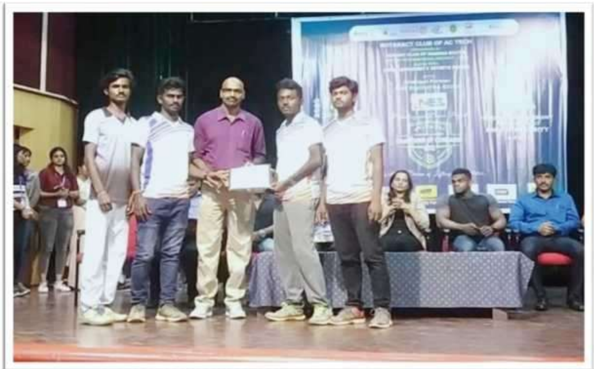
ROTARAT CLUB AC-TECH (ANNA UNIVERSITY) conducted Ball badminton tournament and Secured Third Place.