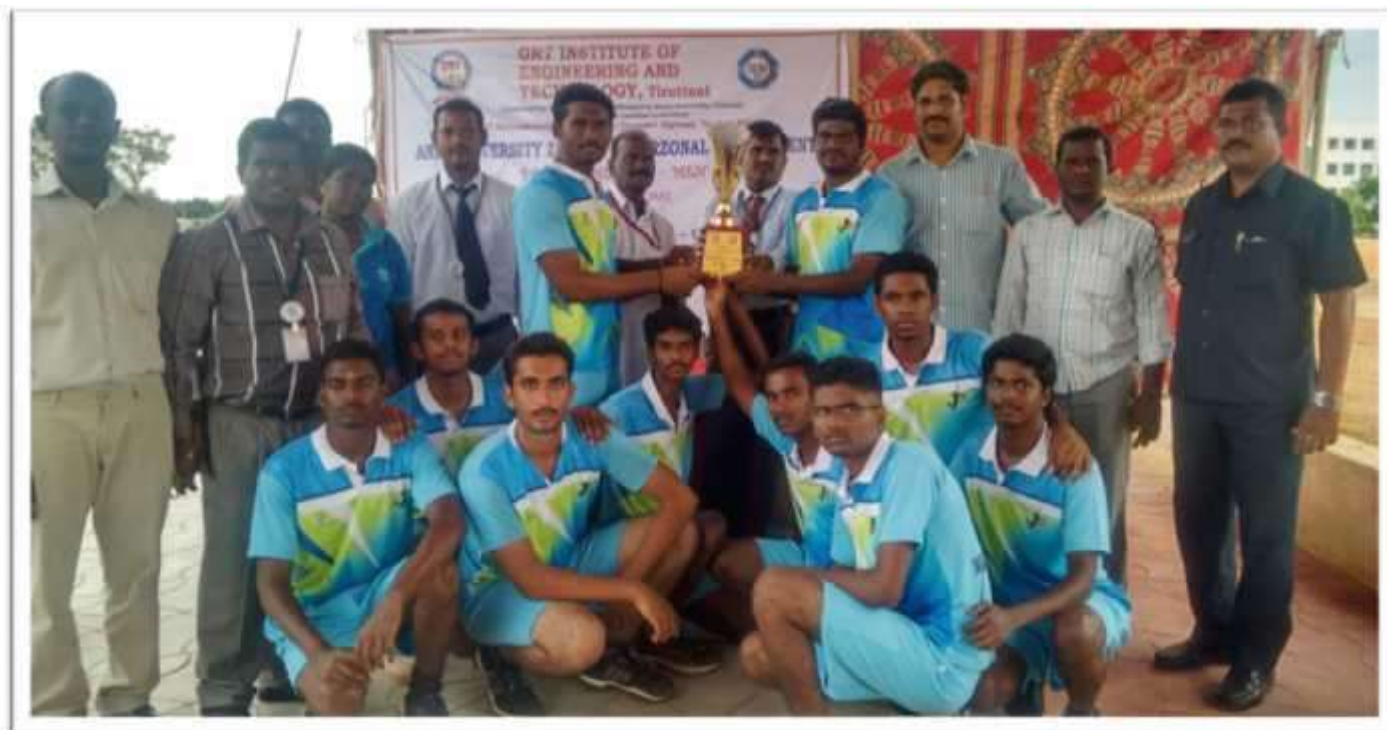
Ball badminton -men team won the Anna University Zonal Tournament-2017-18

Anna University/Approved by AICTE, Accredited by NBA/NAAC -'A' Grade and a recipient of ISO certification