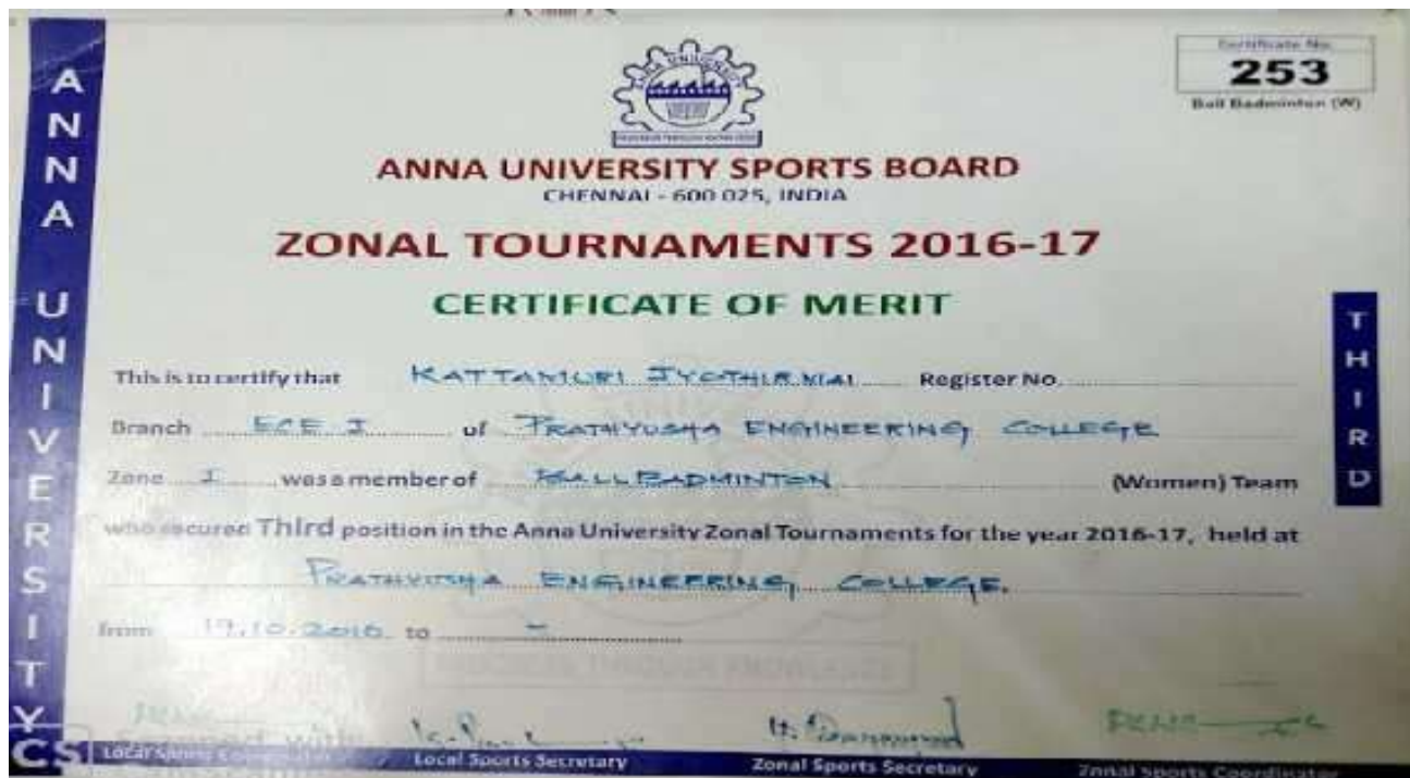
Ball badminton Girls team secured third position in Anna University Zonal matches

Anna University/Approved by AICTE, Accredited by NBA/NAAC - 'A' Grade and a recipient of ISO certification