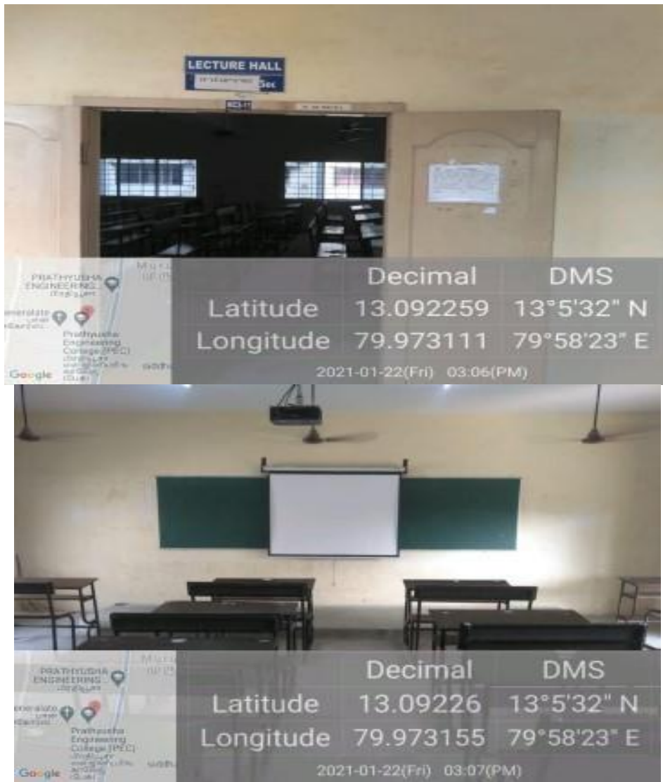
MCS11, CIVIL/MECH Block, 2nd Floor