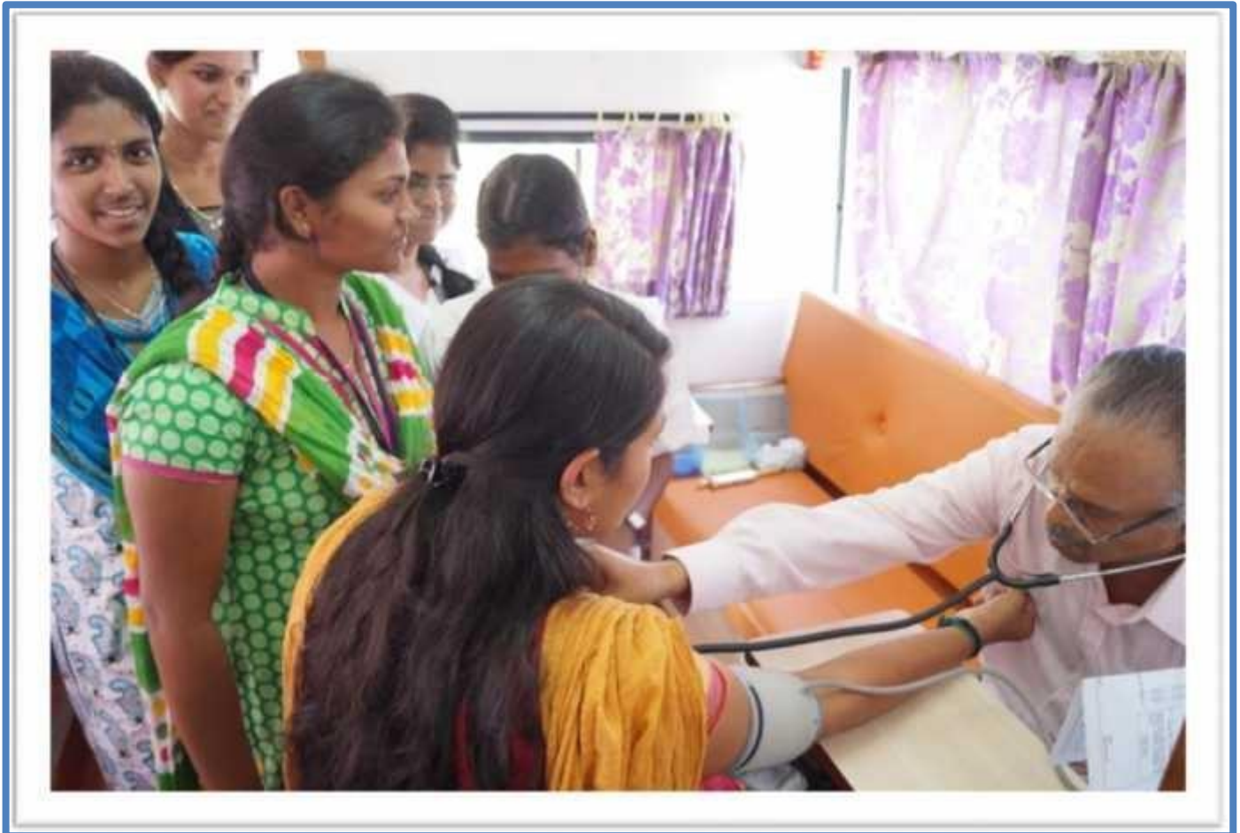
Award for mobilizing more than 200 donors during the blood donation camp conducted at Prathyusha Engineering College