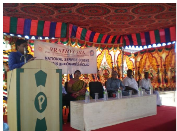
Principal addressing the gathering