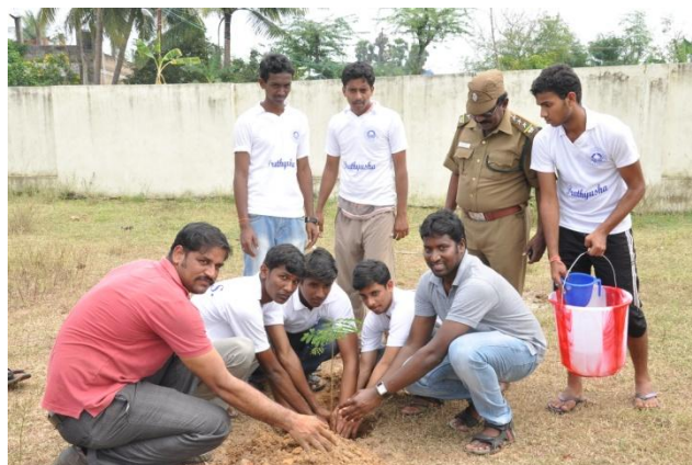
Volunteers planting the sapling with staffs