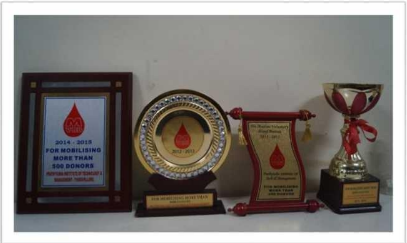
Award from Madras Voluntary Blood Bank To mobilized more than 500 Donors