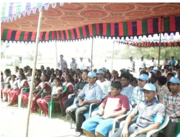
Audience of the Valedictory function