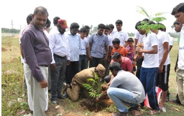
Forest range officer planting the sapling