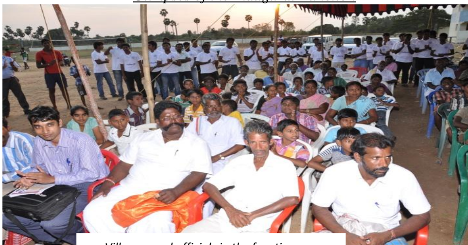
Villagers and officials in the function