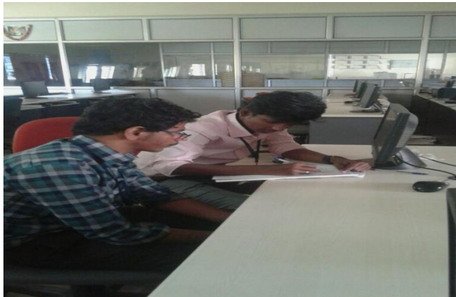
HOW THINGS WORKS