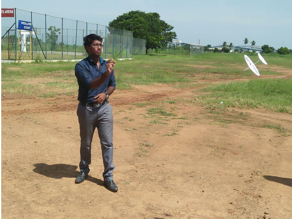
AERO MODELLING COMPETITION