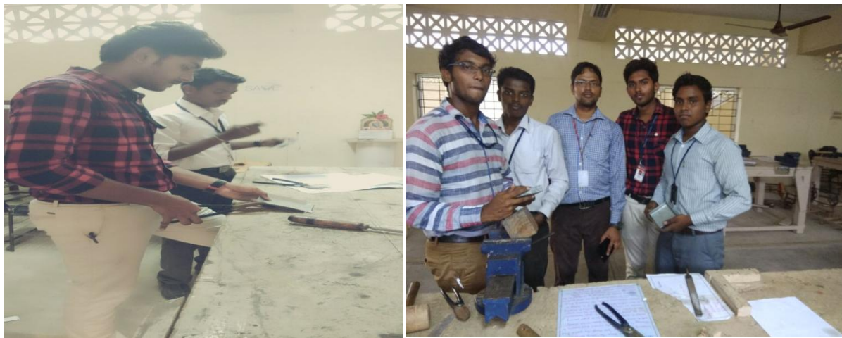
STUDENTS PARTICIPATED IN SHEET METAL PROCESS