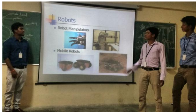
Robotic event presentation