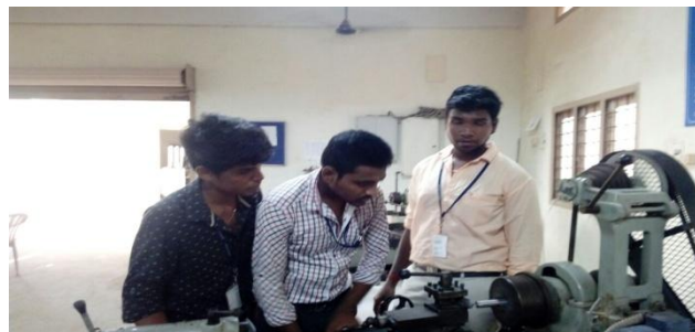
Taper Turning and Threading