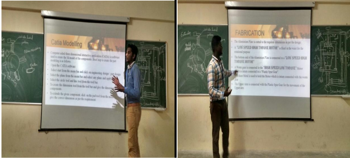
STUDENT PRESENTING THEIR MECHATRONICS PROJECT