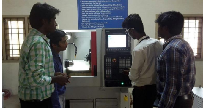
STUDENTS IN CNC TURNING